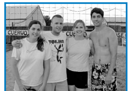
Competitive League Champions "Team Toe Jam"

Each year there are two constants that continue to increase... the level of play and the amount of fun. Look for details on the 2006 season in the spring newsletter and the ESTC Summer Magazine.